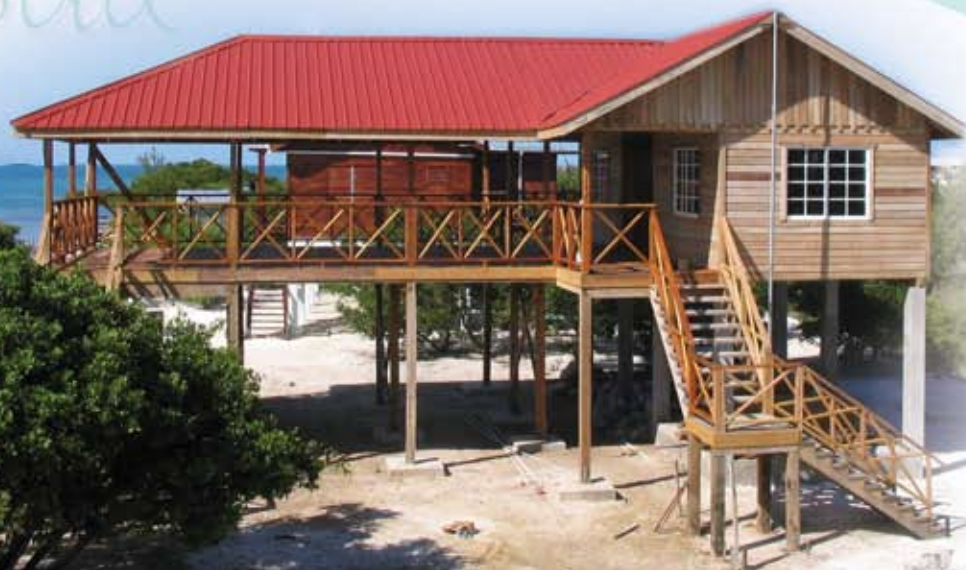
Great Island Yoga Studio located on Southwest Point.

"A lifetime may not be long enough to attune ourselves fully to the harmony of the universe. But just to become aware that we can resonate with it -- that alone can be like waking up from a dream" (David Steindl-Rast)